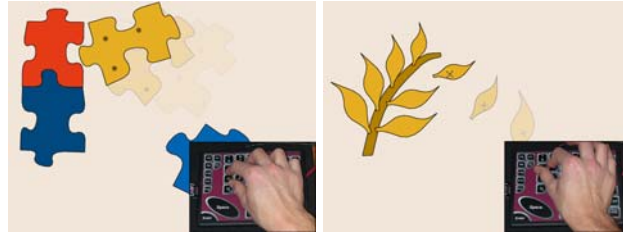
Figure 2. Multi-finger cursor techniques let users control many degrees of freedom simultaneously.